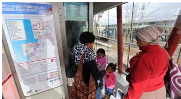
You can load money onto your card at MyCiTi stations.

You have two options to load money onto your myconnect card. Load Standard, or load Mover and save.