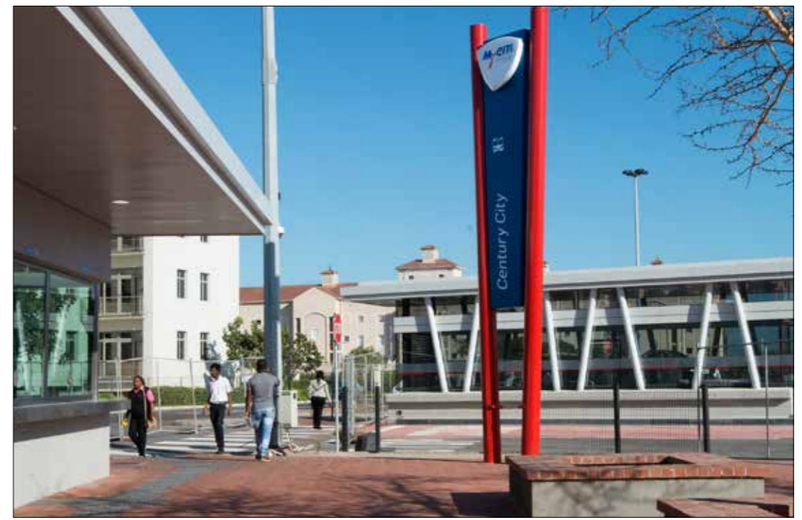
The new route and stations will bring MyCiTi services to new communities while providing a quicker, cheaper option for some passengers already travelling to Century City.

For existing passengers, the service means a much quicker journey between Dunoon and Century City with fewer transfers and a cheaper fare due to the shorter, more direct T04 route. Currently passengers in Dunoon need to change at Table View, Sunset Beach or Racecourse stations, and again at Omuramba to reach Century City. Buses will travel along dedicated red roads, ensuring a quicker journey even in the heavily congested peak hours, with buses departing every 10 minutes in weekday morning and afternoon peaks and every 20-30 minutes at other times, including weekends.