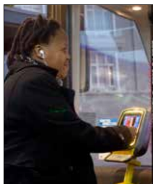
Tap the "IN" validator when you board at a stop.