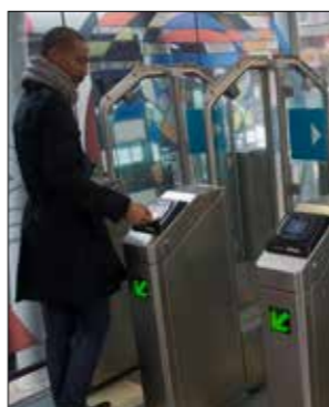
Tap the validator on your right at stations.